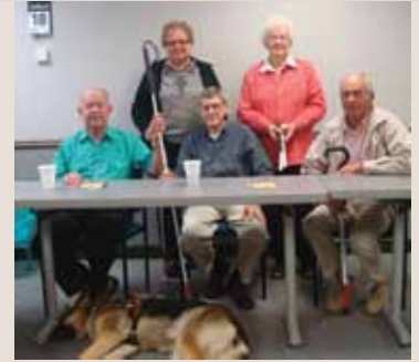
Marshall ATB Group