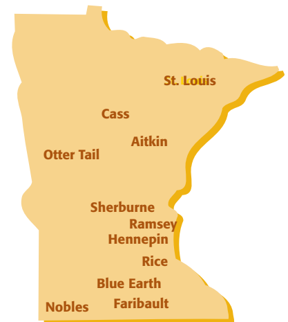
Listening Group County Locations

Participating students spoke freely and identified areas of concern regarding school dropout, both in terms of what makes it difficult to thrive in school and which individuals, systems and policies make it easier to complete and succeed in school.